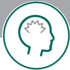
Complaint and Conflict Management

An unhappy client has had various mandates with the trustee spanning several years. With the support of Alithis the structures should now be wound up and the risk of litigation mitigated.