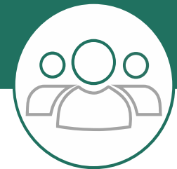
In- und Outsourcing

For trusts or non-profits we are your partner