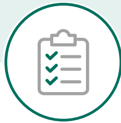
Compliance by Design

Alithis supported the executive committee of an international bank-owned trustee in relation to the updating of the cross-border data sharing framework